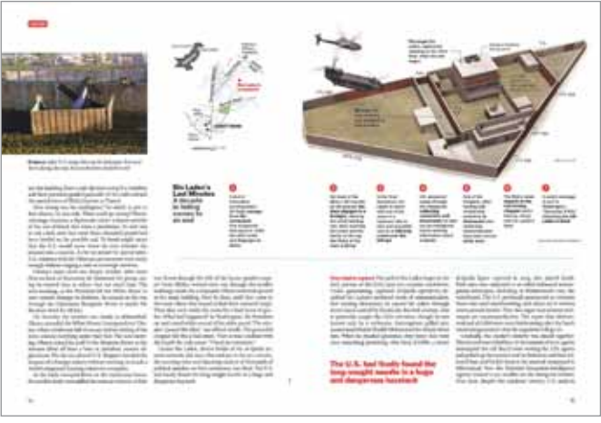
Original Print Design