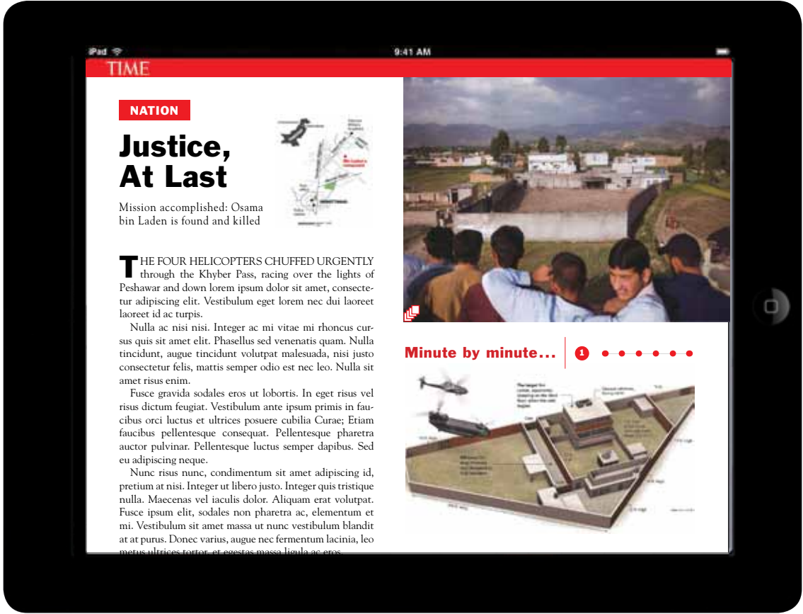
iPad Design, Screen 2 – Landscape Mode (user turns iPad). User selects red dot (1), 'Minute by minute...' title or illustration, which takes them to Screen 3. User can also tap photograph (icon showing 4 photos) and view all photographs presented in article.