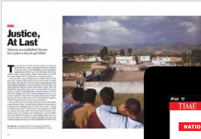
Original Print Design

Prototype for Time magazine Translating existing print design to the Apple iPad iOS