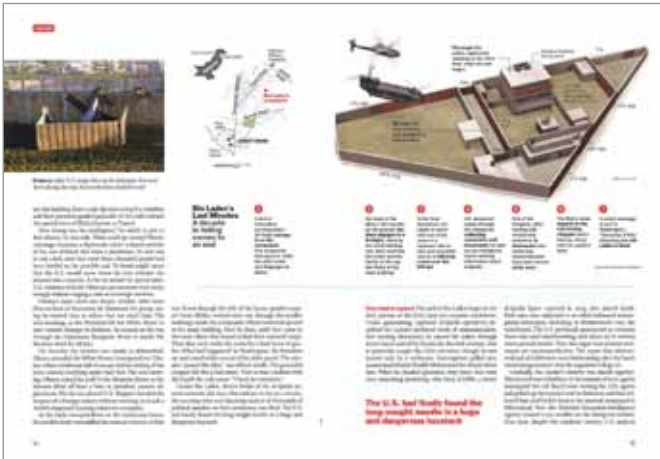
Original Print Design